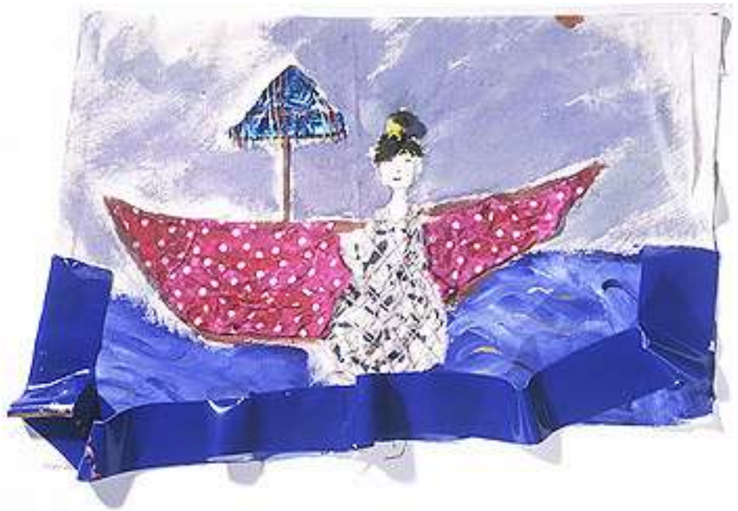
Fisherwoman 2002, by Alice born 1992. Fabric and acrylic paint montage on canvas.